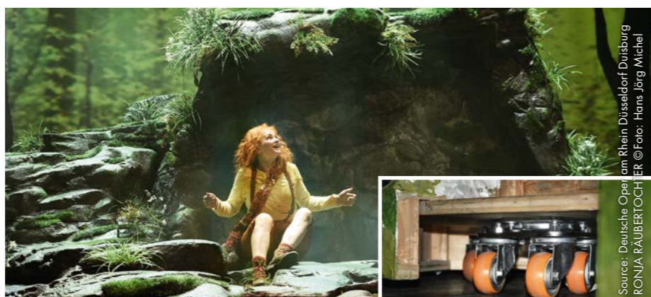
RONJA RAUBERTOCHNER

The use of PEVOPUR® STAGE-SWIVEL in various mobile and rotary walls and elements enables the rapid conversion of stage designs, even those of a large and elaborate nature.